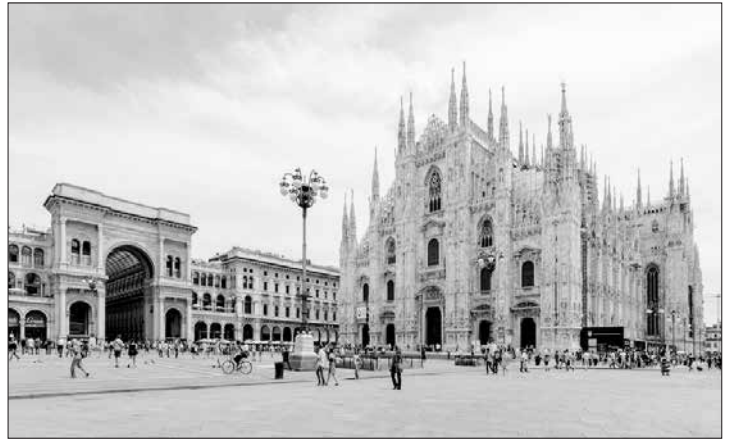
Duomo di Milan to the right of the historic mall Galleria Vittorio Emanuele II

As the fashion center of Italy, Milan offers plenty of shopping. Even if you are a casual shopper visiting the city for its historical sites, you will find yourself drawn to window shopping and linger-